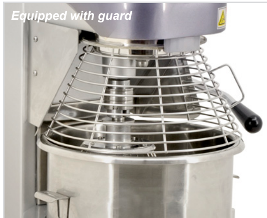
Equipped with guard

Upgraded gear drives for maximum strength and efficiency. Comes with a heavy-duty 2-HP motor. The unit is also equipped with a guard and timer. Stainless steel bowl, wire whip, flat beater and hook included.